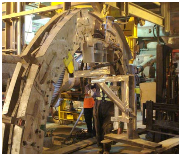
Standard model Fork Truck Bracket shown in use at Lafarge Exshaw

The use of a fork truck bracket enables the arch and frames to be moved without being disassembled , saving time during each use