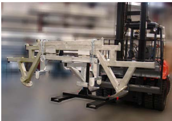
Optional dual model Fork Truck Bracket shown in use in our shop

Arch spanner length is approximately 6 feet (182.88cm)