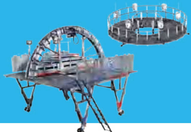
BRICK LINING MACHINES