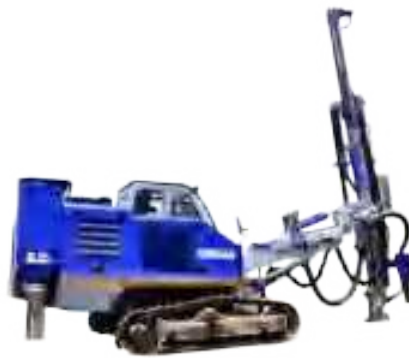
CRAWLER DRILLING RIG