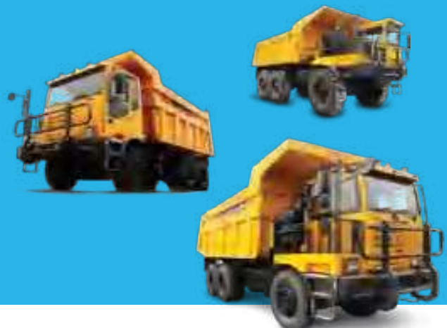
OFF-ROAD DUMP TRUCK